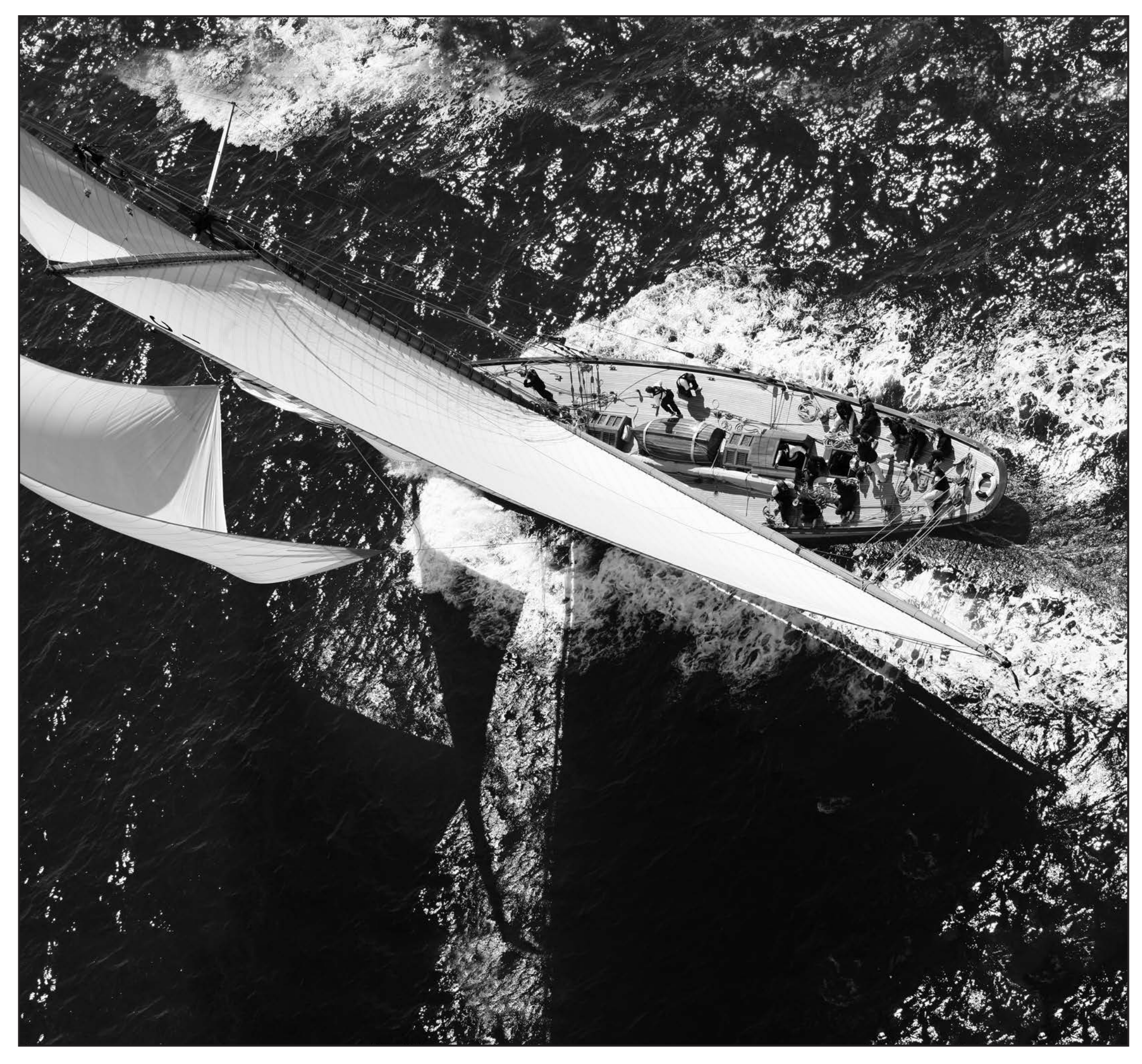
Sole survivor. Nineteen Metre Mariquita reaches across Carrick Roads at Falmouth Classics.