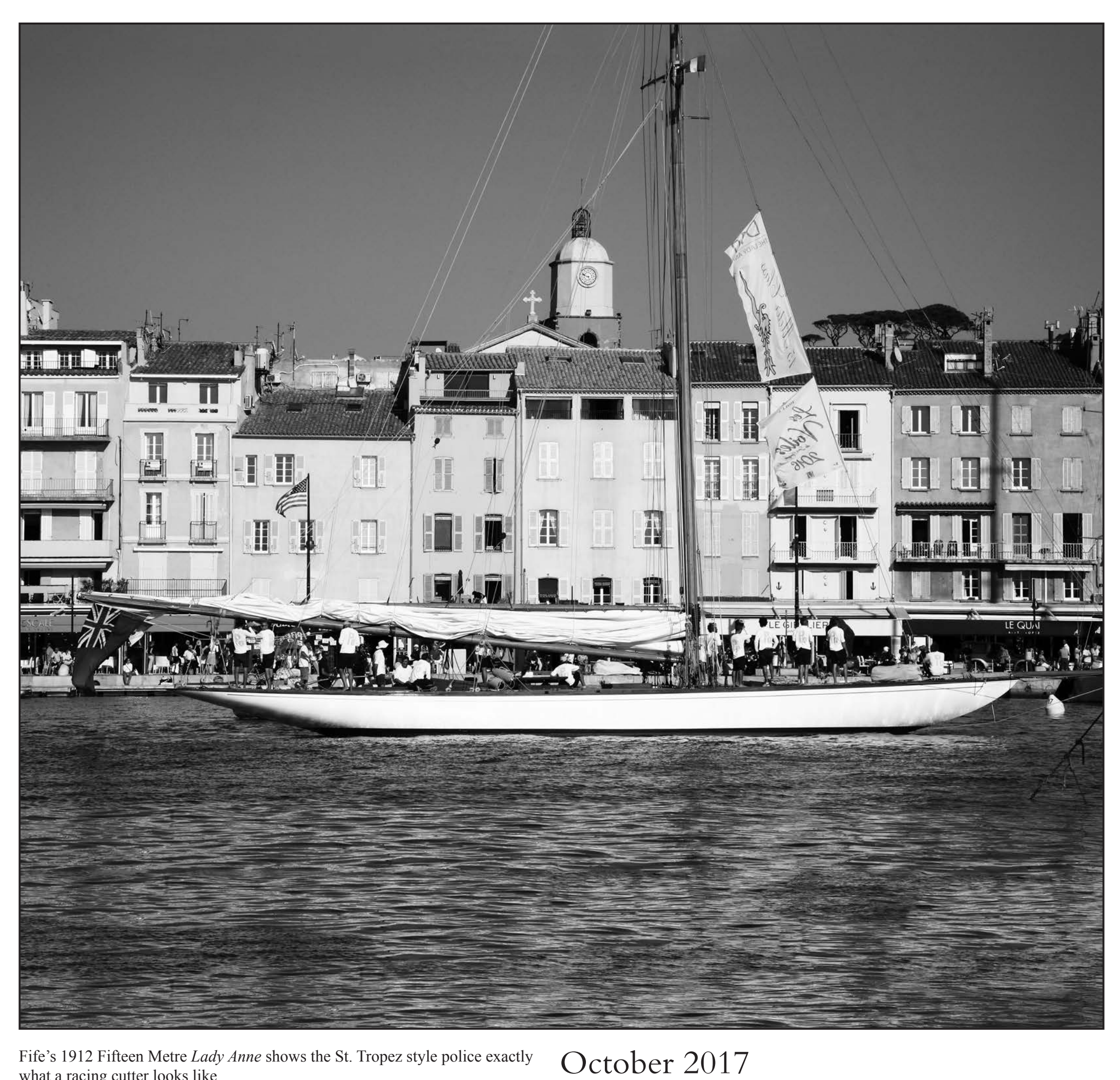
Fife's 1912 Fifteen Metre Lady Anne shows the St. Tropez style police exactly what a racing cutter looks like.