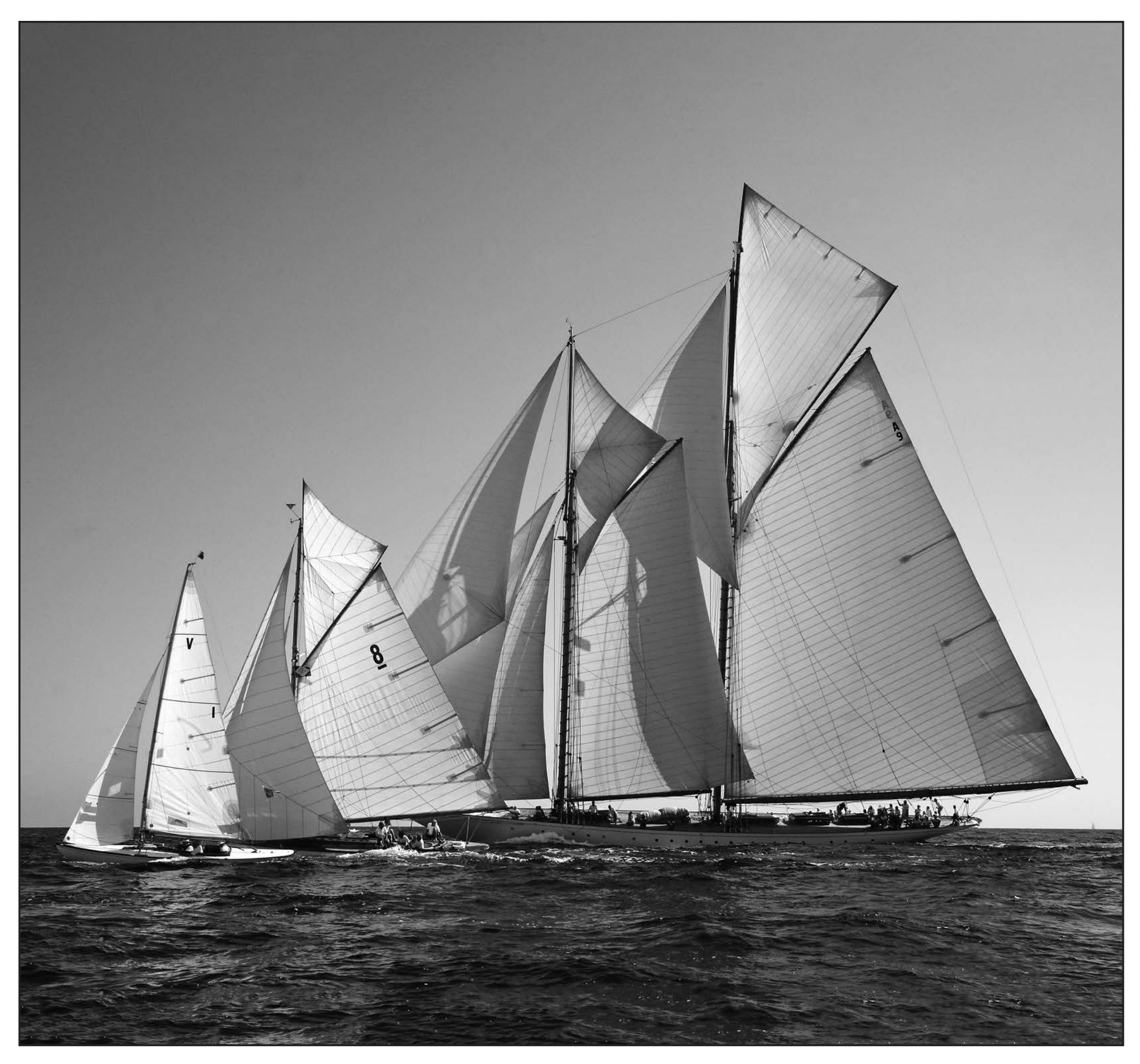
Solent sunbeam Daisy VI, 8 metre Nin and Elena present a challenge to the handicapper.